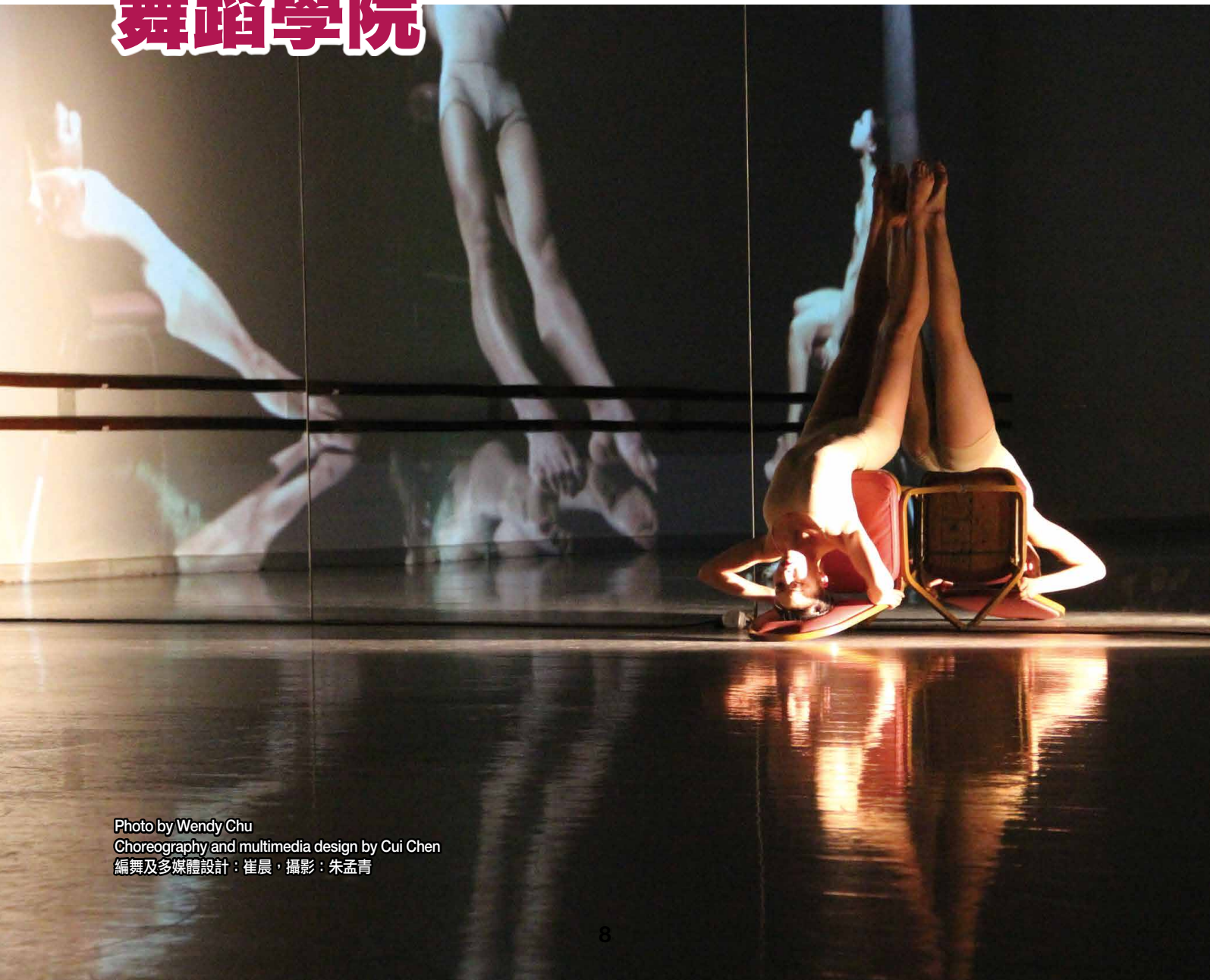
Photo by Wendy Chu Choreography and multimedia design by Cui Chen 編舞及多媒體設計：崔晨，攝影：朱孟青