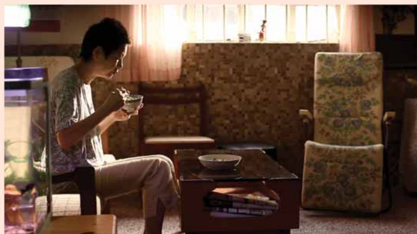
Big Blue Lake 《大藍湖》

吳煒倫 （2000年藝術學士），與多年拍檔林超賢的最新作《激戰》好評不絕，賣座突破四千萬，成為本年度最賣座香港電影；