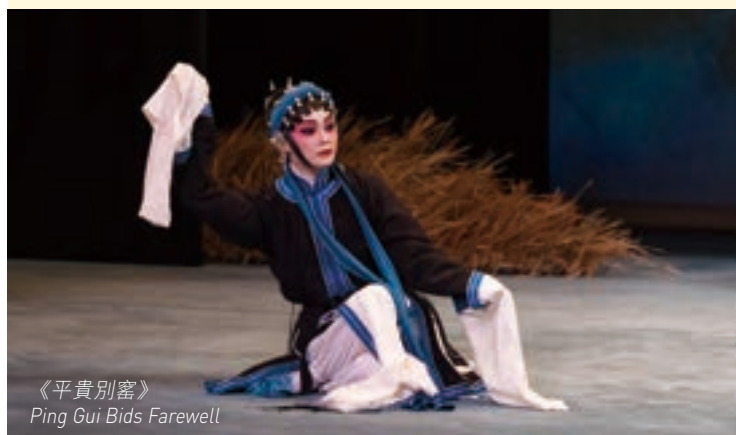
《平貴別窰》 Ping Gui Bids Farewell