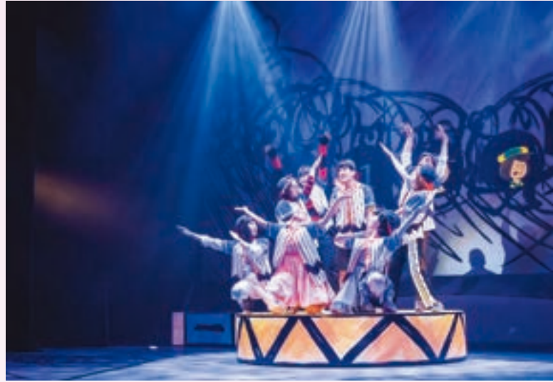
Musical : You're A Good Man, Charlie Brown 音樂劇：《最好先生 Charlie Brown》

戲劇畢業生的工作機會十分專業化和多樣化，部分畢業生加入本地戲劇團體或電視台，如香港話劇團、中英劇團、無綫電視、有線電視及 ViuTV 等。有些以自由工作者形式參與電影、電視和新媒體創作，或創立自己的新劇團。有部分學生則參與和表演藝術有關的教學及行政工作等。