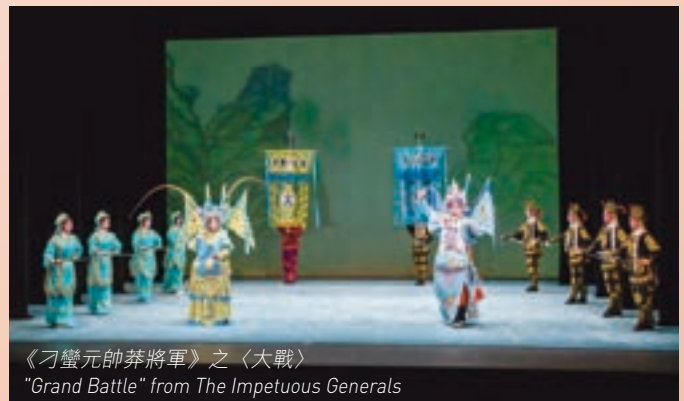
《刁蠻元帥莽將軍》之〈大戰〉 "Grand Battle" from The Impetuous Generals

一年全日制課程旨在為學員提供穩固的戲曲基礎訓練，為進一步的研習奠下紮實基礎。基礎粵劇文憑課程提供表演及音樂兩項主修。