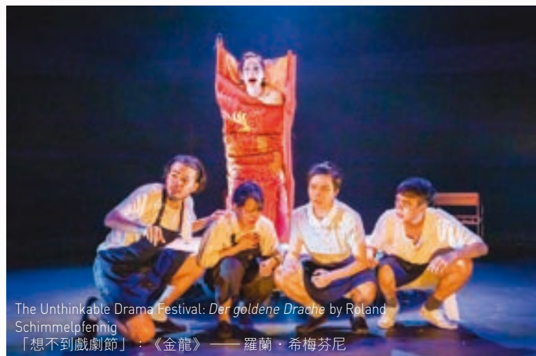
The Unthinkable Drama Festival: Der goldene Drache by Roland Schimmelpfennig 「想不到戲劇節」：《金龍》——羅蘭·希梅芬尼

報讀藝術學士課程的申請非常踴躍，競爭激烈。對表演藝術有興趣的人士均歡迎報讀。報讀應用劇場系、導演系及劇場構作系的考生如已取得其他學士資格，將獲優先考慮。