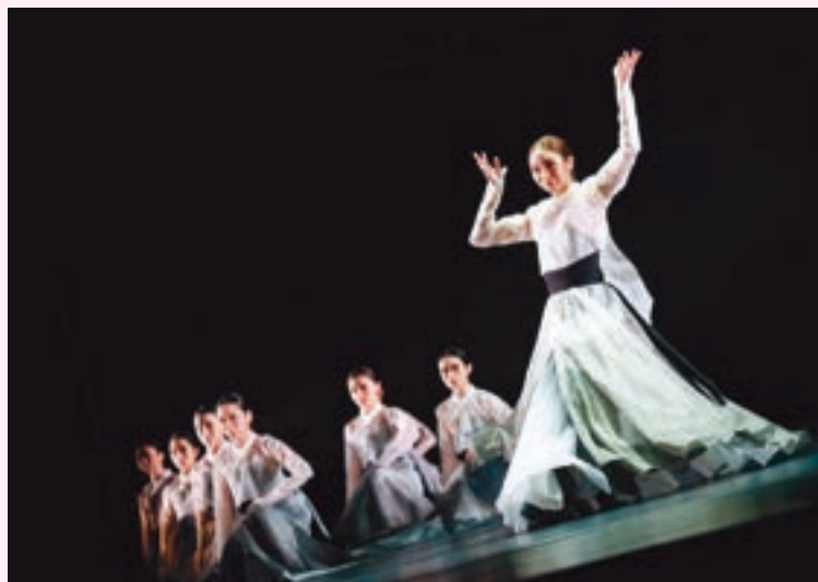
Drum by Yu Pik-yim, Li Zhangliang 余碧艷、李璋亮《鼓·道·行》