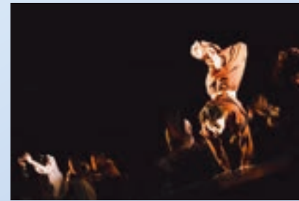
Coven by Mickael 'Marso' Riviere (Photo by Liu Sheung-yin) 江華峰《聚》(廖尚賢攝影)