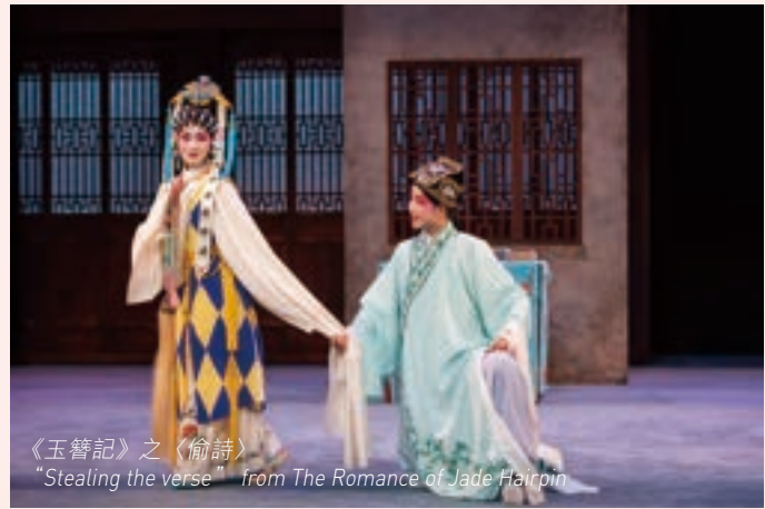
《玉簪記》之〈偷詩〉 "Stealing the verse" from The Romance of Jade Hairpin

戲曲藝術學士(榮譽)學位課程提供表演及音樂兩項主修。旨在發展學生之學術及智能達至學歷架構第五級及專業水平之戲曲表演技巧。課程亦重視發展學生之藝術創意和獨立性和對戲曲與其他學科和藝術相互關係之認識，以鼓勵學生擴展知識層面。學生學習戲曲之審美及發掘傳統創作過程之新應用。課程的畢業生將會是有效推動戲曲藝術的專門人才。