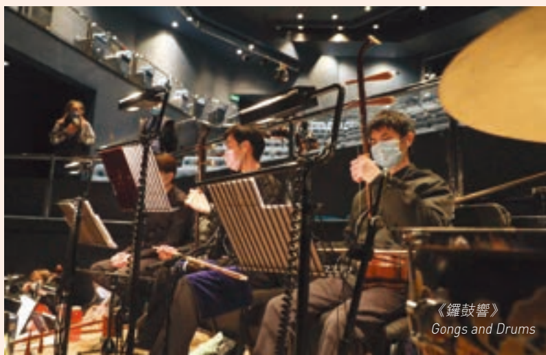
《鑼鼓響》 Gongs and Drums

學員畢業後可受僱於香港不同的粵劇團體，亦可自組粵劇團或以自由工作者身分擔任演員、伴奏樂師、粵劇/粵曲導師、編劇、評論、研究員或參與不同的創意專業。政府會堂及文娛中心亦常聘用對粵劇有認識的行政及管理人員。畢業生亦可從事粵劇教育及推廣工作。