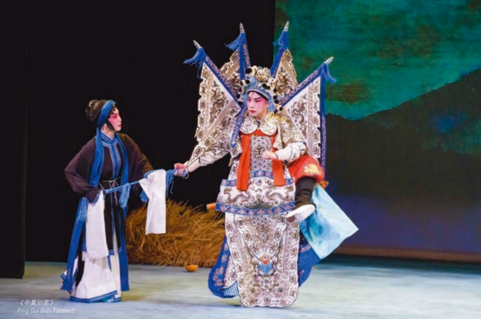
《平貴別窰》 Ping Gui Bids Farewell