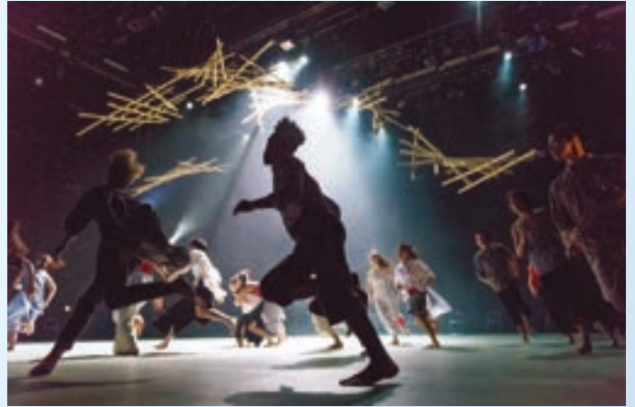
Three Fingers at Arm's Length by Leila McMillan (Photo by Felix Chan) 麥麗娜《Three Fingers at Arm's Length》(陳振雄攝影)