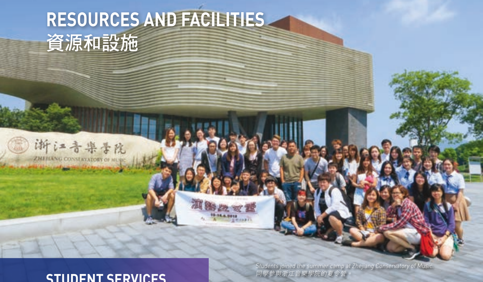
Students joined the summer camp at Zhejiang Conservatory of Music. 同學參與浙江音樂學院的夏令營。