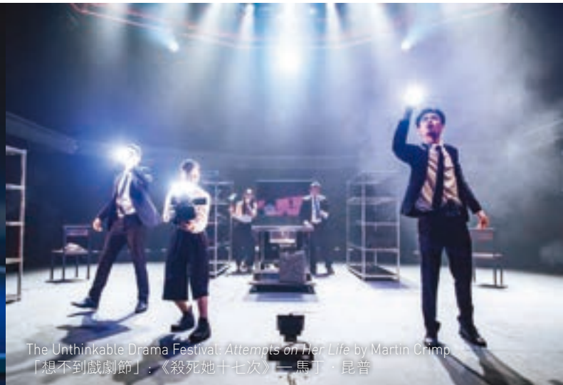
The Unthinkable Drama Festival: Attempts on Her Life by Martin Crimp 「想不到戲劇節」：《殺死她十七次》——馬丁·昆普