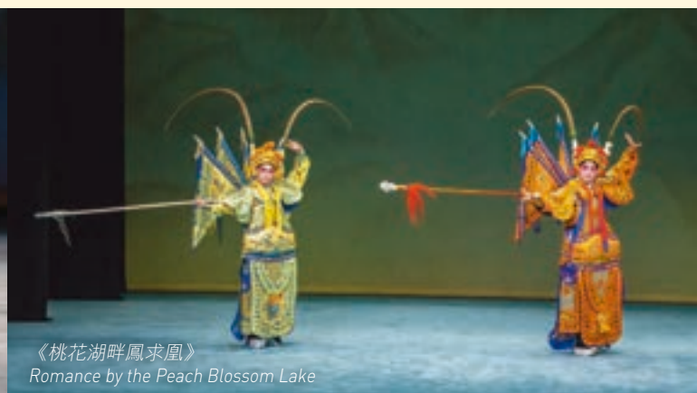
《桃花湖畔鳳求凰》 Romance by the Peach Blossom Lake