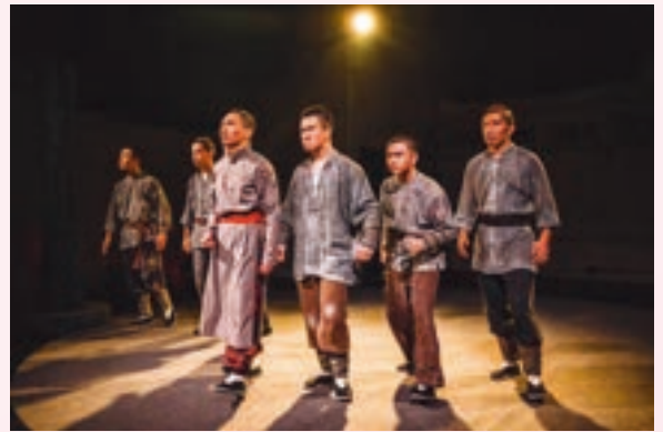
Ng Wong the Swordsman 《大刀王五》

Drama is at the very heart of human expression, its communication and identity. The School of Drama believes that its unique position in Asia offers an insight into this artform that will both inform and develop significant creativity and distinctive artists to engage with and feed the cultural community of Hong Kong, the Mainland and beyond. The School of Drama strives to be an incubator, catalyst and repository of the values and importance of the dramatic and performative arts and expresses this in the nurturing of actors, directors, playwrights, dramaturgs and teachers who will function as practitioner-artists making a tangible difference to their community and their chosen discipline.