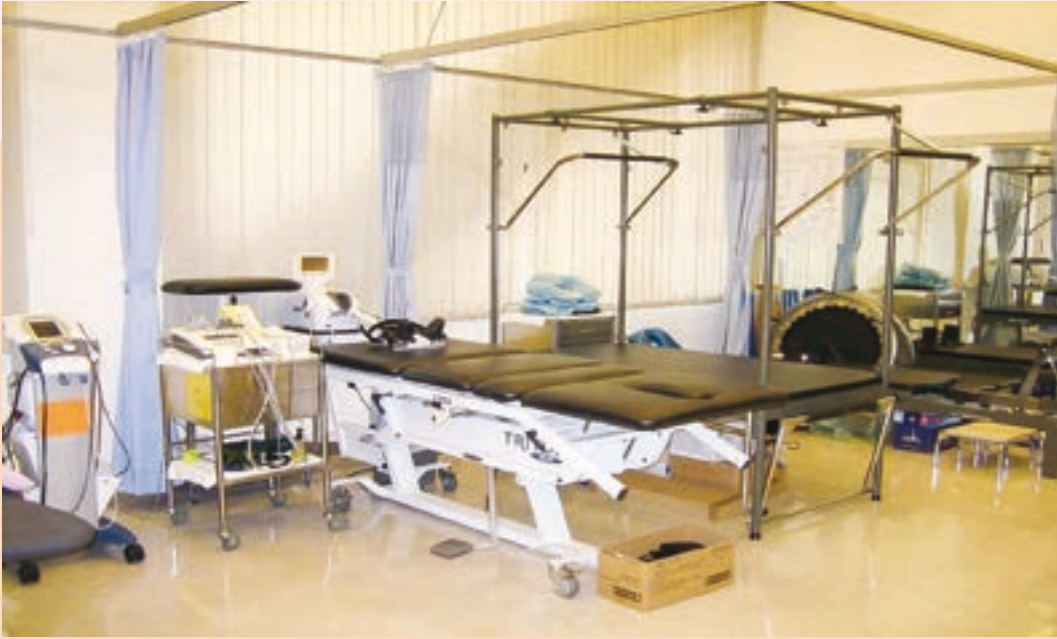
The Physiotherapy Clinic 物理治療診所