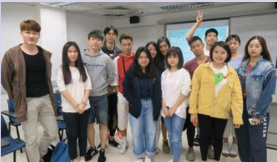
Gatherings for newly arrived non-local students and their buddy mentors 非本地新生及師友參與活動