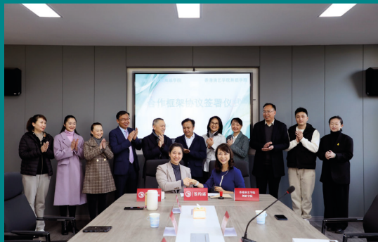
The signing of MOU wishes to ignite sparks in the artistic exchange. 合作框架協議的簽訂可望為兩校藝術交流帶來新火花。

演藝學院舞蹈學院於去年十二月與雲南藝術學院舞蹈學院簽訂合作框架協議，以進一步促進兩校互訪合作，推動舞蹈藝術創新交流。🌟