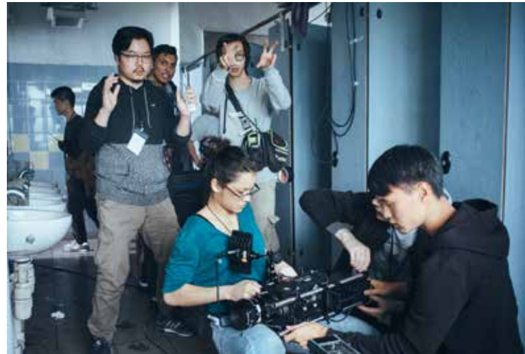
MFA thesis project film: Rebound . 碩士研究生畢業作品《Rebound》

除一般入學條件，申請者亦須於入學申請書中，列明其專業範疇的意願。除填寫個人意向書外，還須提交過往電影創作的影片樣本，或曾參與有關電影製作的證明，以支持其入學申請。