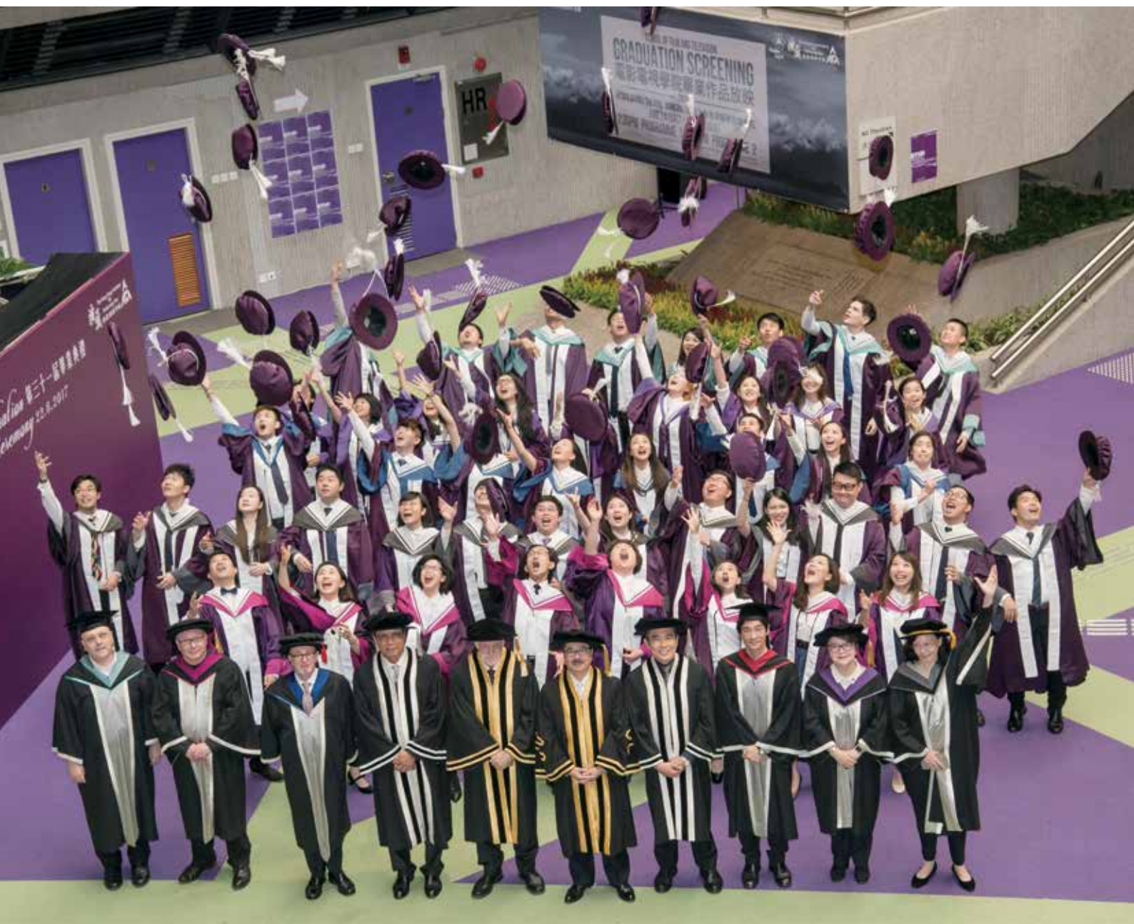
31st Graduation Ceremony 第 31 屆畢業典禮