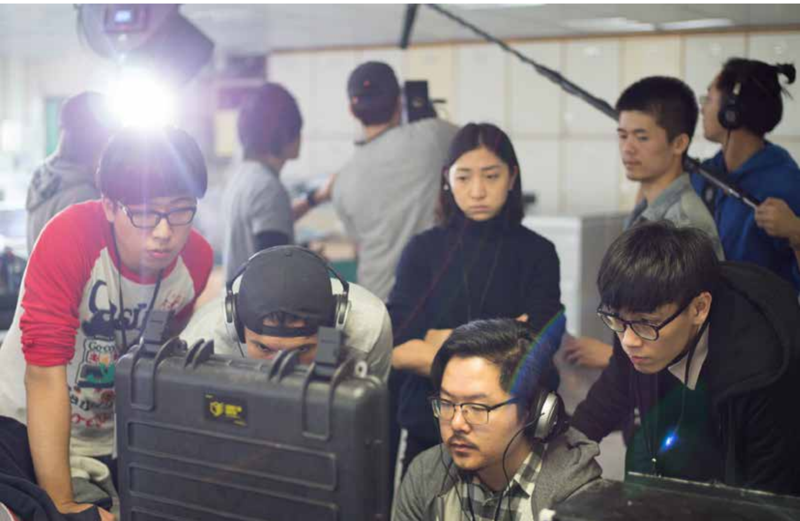
MFA thesis project film: Rebound . 碩士研究生畢業作品《Rebound》