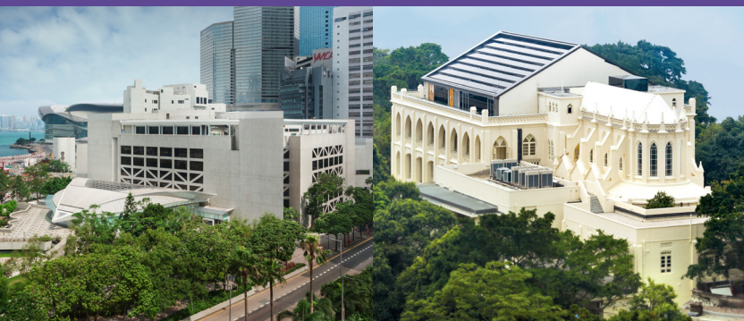
灣仔本部 Main Campus in Wanchai