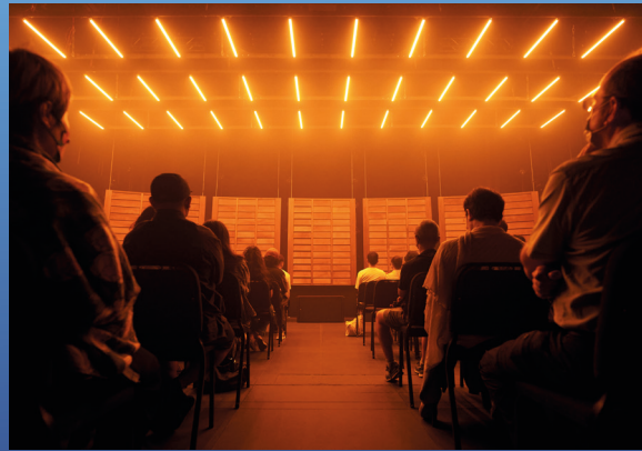
Produced by the School of Theatre and Entertainment Arts, Sunset Concert has been a prominent stage for emerging artists and local musical talents, integrates lighting, sound, visual and technical design. Photo of Sunset Concert 2021. 日落音樂會由舞台及製作藝術學院製作，演出結合燈光、音響、影像和技術設計，每年均邀請來自本地不同音樂範疇，且充滿潛力的音樂人和樂隊參與。照片為日落音樂會 2021。

They are wise words. It is only by sustaining a positive mindset and equipping ourselves in difficult times that we can rise to new opportunities. ▲