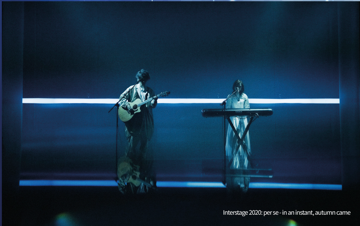
Interstage 2020: per se - in an instant, autumn came