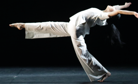
Upon Calligraphy (Excerpts) 《臨池舞墨》(選段)