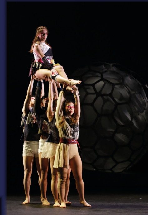
Lost Paradise 《迷失天堂》