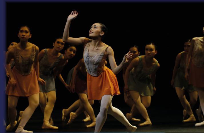
The Acceptance of Being 《接納存在》