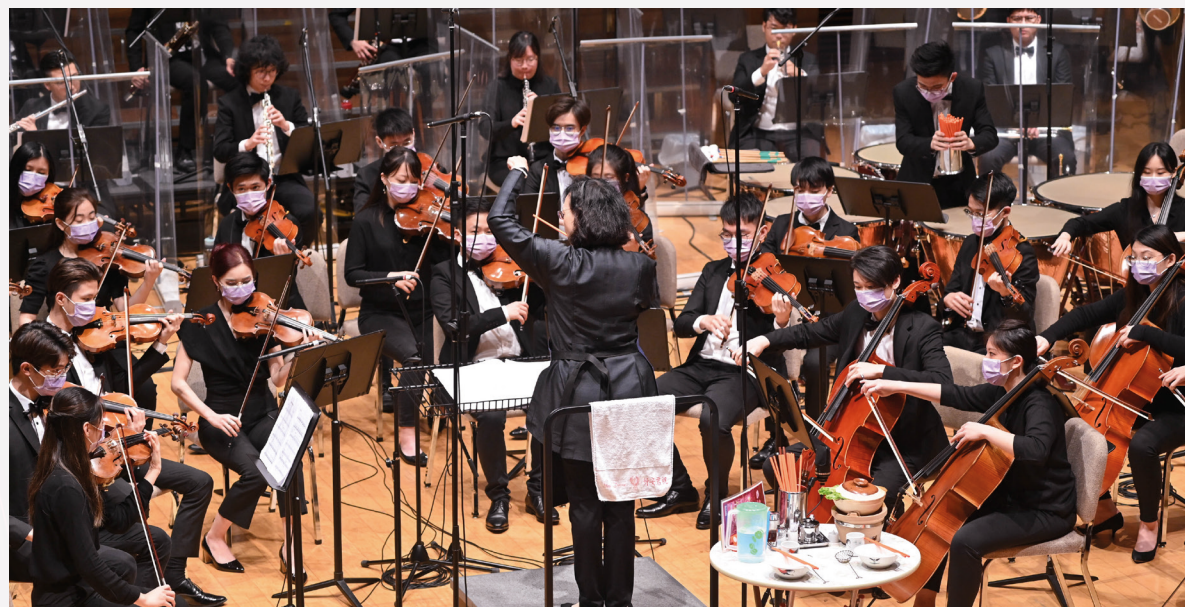
Academy Symphony Orchestra performing award-winning piece Dai Pai Dong . 演藝交響樂團演奏得獎作品《大排檔》。

The Hong Kong Academy for Performing Arts proudly celebrated the 25 th anniversary of the establishment of the HKSAR at the celebration concert with generous support from the Swire Group. The Academy, in partnership with the Swire Group, also announced the founding of the Greater Bay Area Youth Orchestra – a pioneering youth initiative fostering cultural exchange across the region.