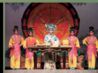
The Sounds of Battle 《雷鳴金鼓戰笳聲》