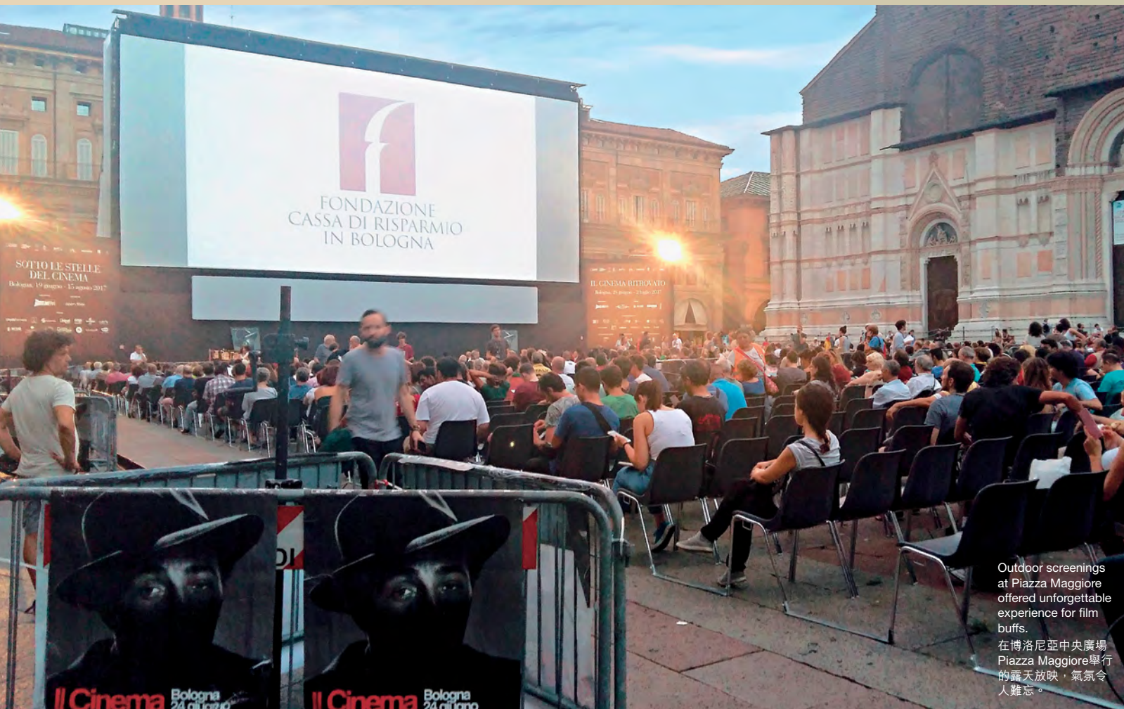
Outdoor screenings at Piazza Maggiore offered unforgettable experience for film buffs. 在博洛尼亞中央廣場 Piazza Maggiore 舉行的露天放映，氣氛令人難忘。