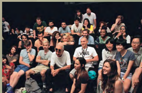
Students screened their previous short films to Tarr for critique and advice. 每位學員都會在工作坊放映個人作品，讓貝拉塔爾與學員一同討論。