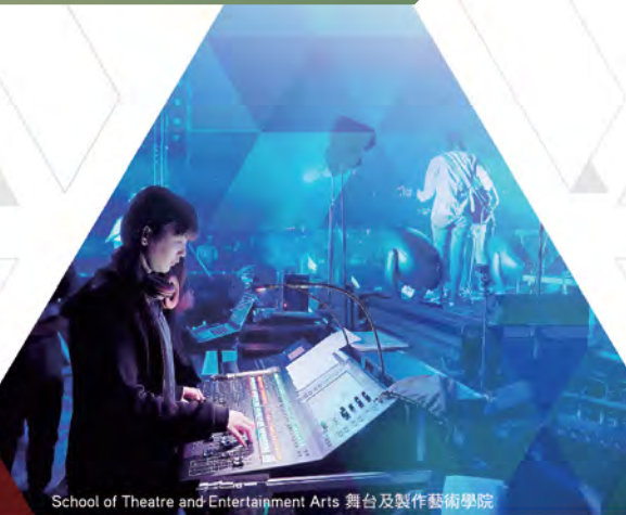
School of Theatre and Entertainment Arts 舞台及製作藝術學院