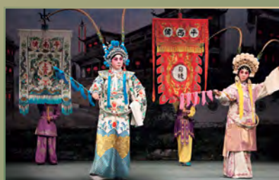
A Warring Couple 《龍鳳爭掛帥》