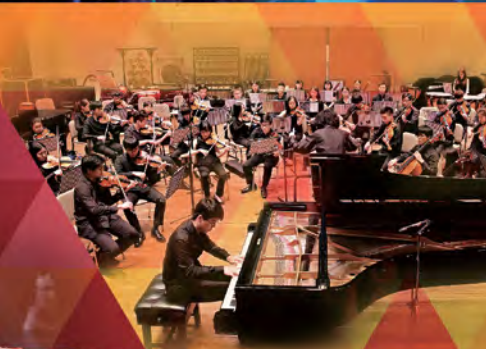
School of Music 音樂學院