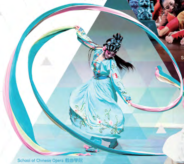
School of Chinese Opera 戲曲學院