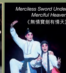
Merciless Sword Under Merciful Heaven 《無情寶劍有情天》