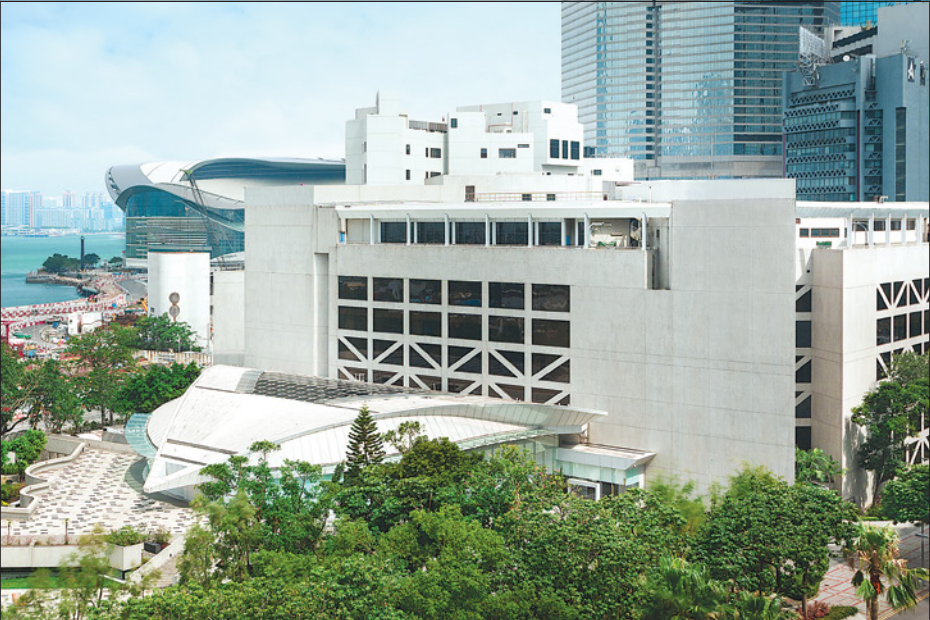
Main Campus in Wanchai 灣仔本部